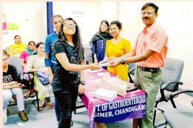
Kids were rewarded for scoring above 80% in board examination.