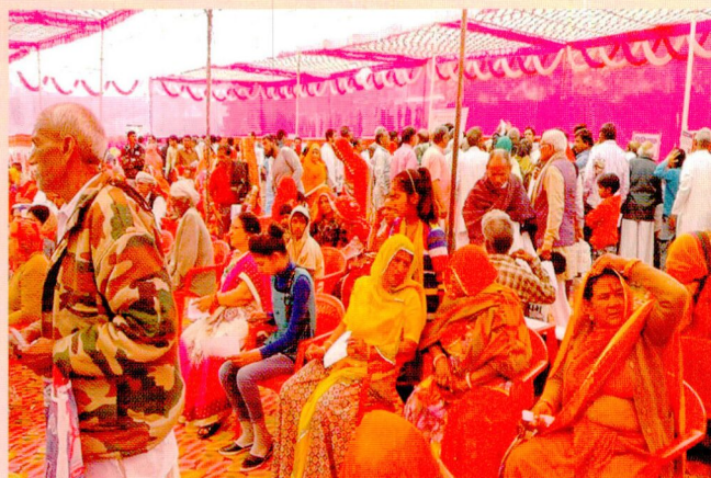
A record, 4136 patients screened at RATANGARH.