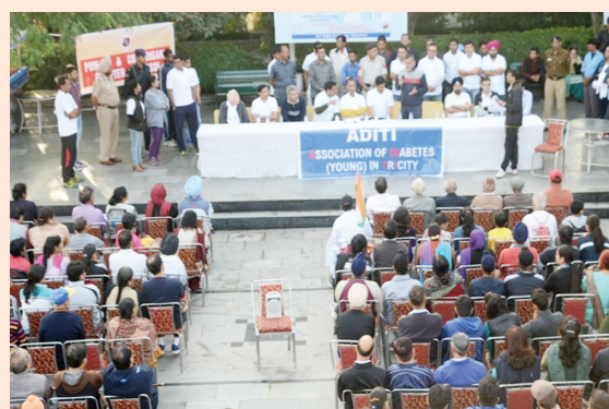
Awareness by experts