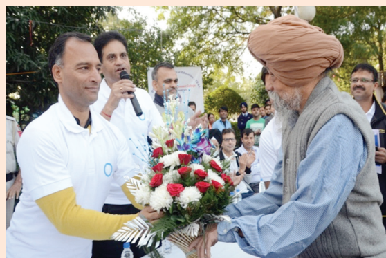
Honor to type 1 diabetes mellitus fighter