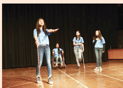
Medical college students performing skit