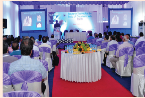
RSSDI Kerala Chapter conference