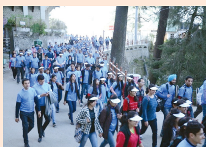
People's participating in the walkathon