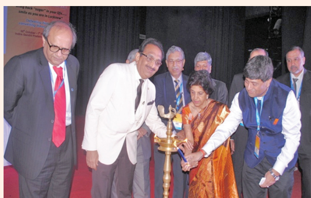
Lamp lighting ceremony at RSSDI 2015

Annual conference of the RSSDI for the year 2015 was held at Indira Gandhi Pratishthan, Vibhuti Khand, Gomti Nagar in Lucknow from October 30 to November 1, 2015. A total of 5,815 delegates and 427 faculties from across the world participated in the conference. A total of 64 foreign delegates participated and presented their research papers. A total of research papers have been presented in various sessions. For the first time, RSSDI started its fellowship program which were conferred to 30 experts across India and 6 senior doctors were honored with "Distinguished Services Award" during convocation held for the first time. This conference shall be remembered for many things held first time like release of recommendations for diabetes management for the first time by RSSDI, paramedical training program organized first time, and innovative workshops like medical writing, research methodology, sleep apnea, and diabetic retinopathy. On the last day of the conference, a walkathon was organized, which was flagged off by Ms Neha Dhupia former, Femina Miss India, motivating youngsters for daily exercise and mindful eating. Late in the afternoon when conference was over, session were organized for public education by RSSDI-UP Chapter with huge participation from the public and 150 kids suffering type 1 diabetes who later had a candle march in Indira Gandhi Pratishthan where the conference was held.