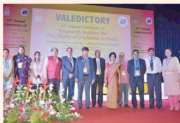
Valedictory, RSSDI 2015