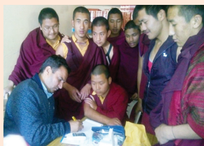
Tibetan monks in a diabetes detection camp in Shimla