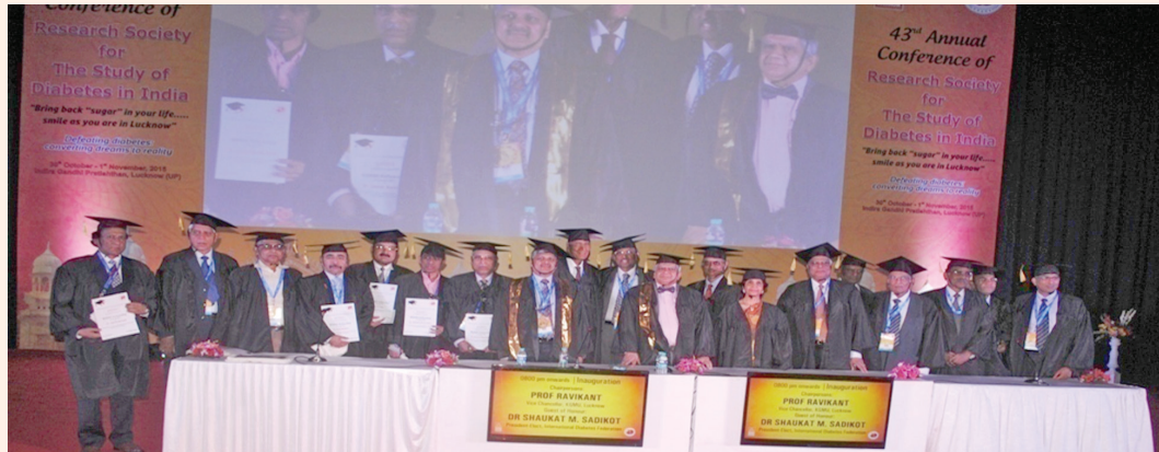
RSSDI Fellowship award ceremony - 2015