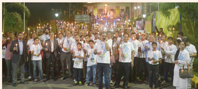
Walkathon was organized, which was flagged off by Ms Neha Dhupia