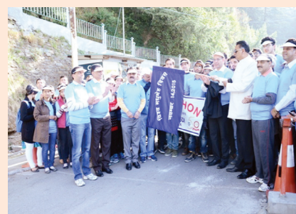
Diabetes awareness walk being flagged off by Hon'ble Judge of the Hon'ble High Court