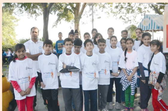
Kids with type 1 diabetes mellitus