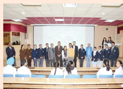
School and medical students participating in quiz competition on diabetes