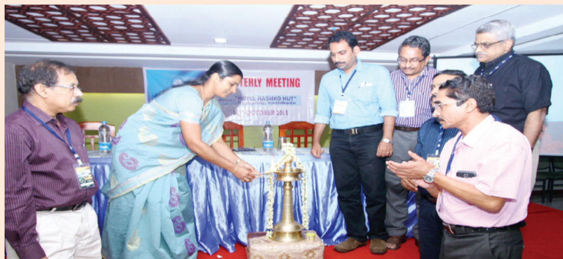
RSSDI Kerala Chapter along with Indian Institute of Diabetes Trivandrum conducting medical camp public awareness program and exhibition on November 14, 2015 (World Diabetes Day)

About 85 delegates participated. All the scientific sessions were well appreciated. The meeting concluded at 2:30. Credit hours were also granted by TCMC.