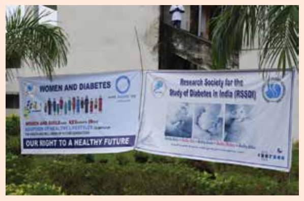
Walkathon Conclusion on World Diabetes Day