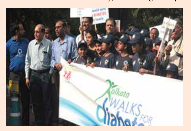
World Diabetes Day 2017, Kolkata, walks for diabetes walkathon

On the occasion of World Diabetes Day, West Bengal Chapter organized a walkathon "Walk For Diabetes" in Kolkata.