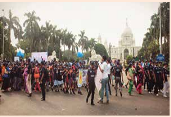
World Diabetes Day walk for diabetics, kids joining the walk