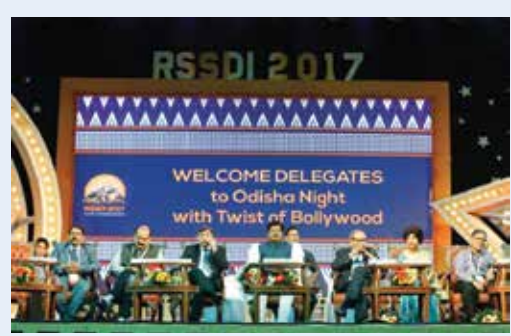
Inaugural meeting of 45th Annual Conference of National RSSDI 2017, Janata Maidan, Bhubaneswar.