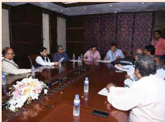
22<sup>nd</sup> October, EC Meeting, at Mayfair Convention, board room