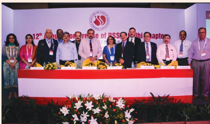
12 th Annual Conference of RSSDI Delhi Chapter