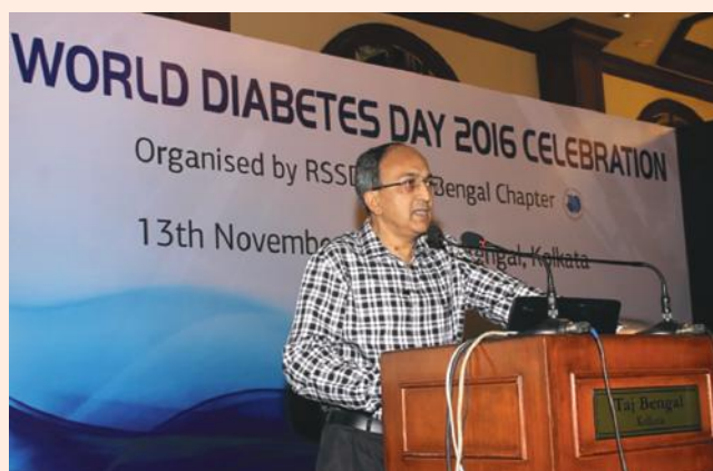
World Diabetes Day, 2016