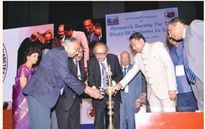
Lamp lighting ceremony, RSSDI – 2016