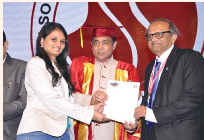
Receiving certificate for Certificate Course in Diabetology