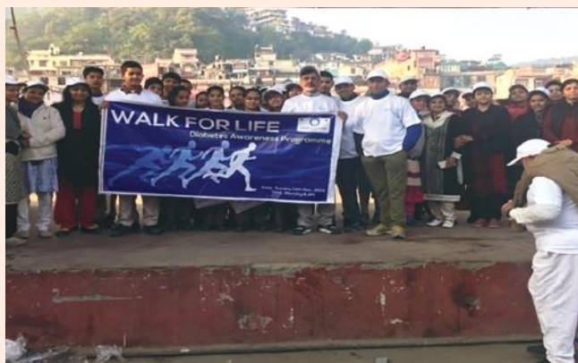
Himachal Pradesh Chapter of RSSDI celebrating World Diabetes Day