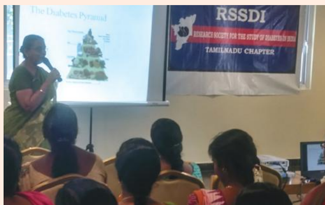
Doctors training program