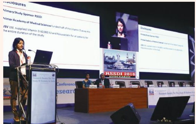
RSSDI funded research project presentation