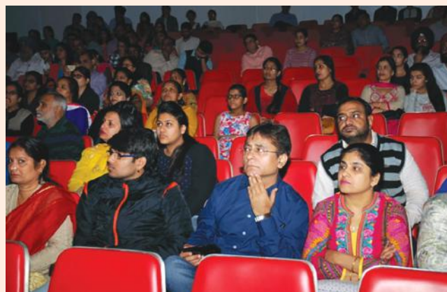
Type 1 Diabetes Education Day on World Diabetes Day on 14 th November 2016