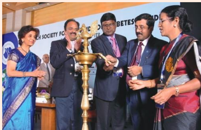
Lamp lighting ceremony