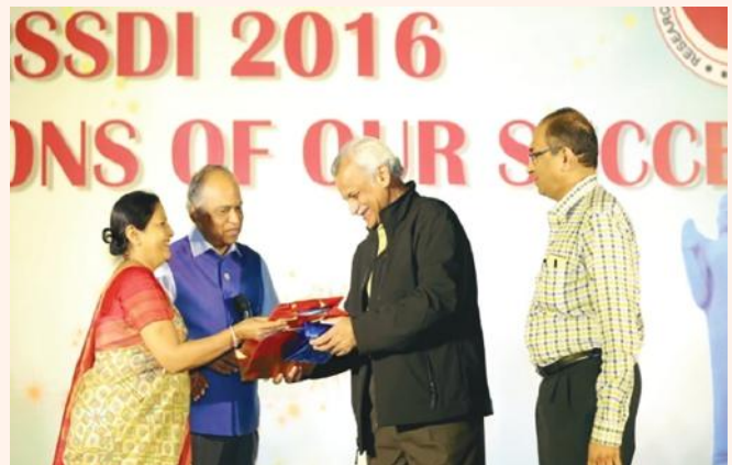
Celebrations of our success, RSSDI – 2016