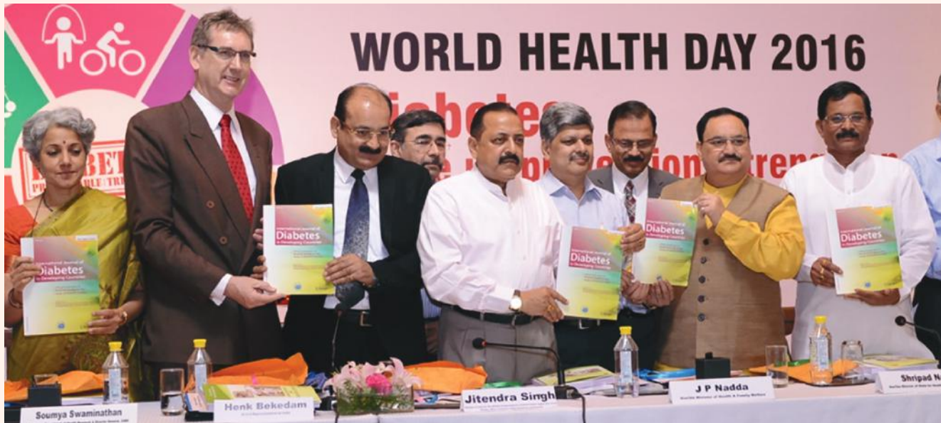
RSSDI Clinical Practice Recommendations were released on World Health Day

RSSDI Clinical Practice Recommendations were released on World Health Day, 7 th April 2016, at a ceremony organized by Ministry of Health Government of India.