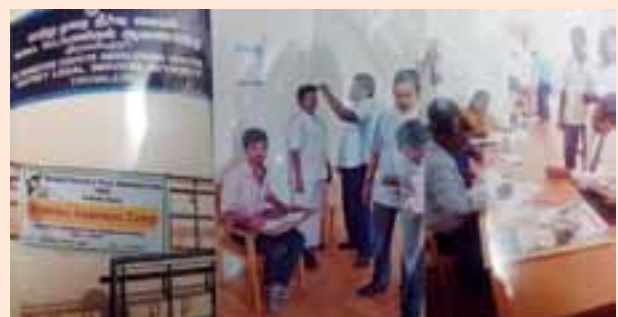
Diabetic screening awareness camp