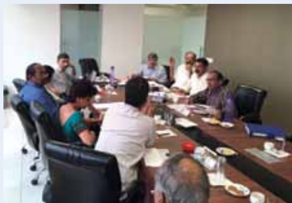
National RSSDI Executive Committee Meeting