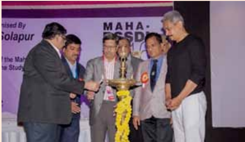
Inauguration by dignitaries