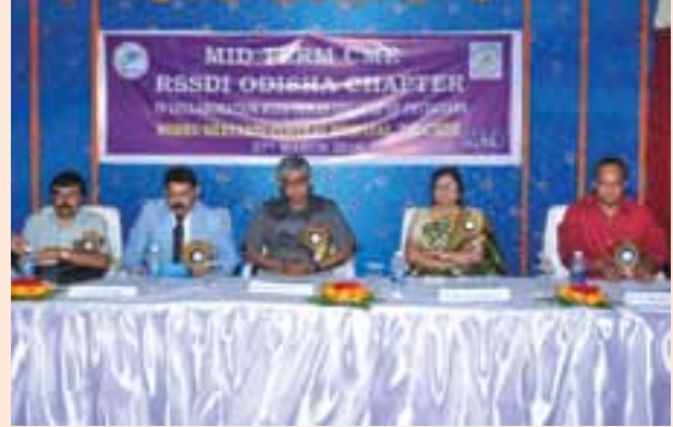
RSSDI Odisha chapter Midterm CME

4 th Annul Conference of RSSDI Odisha State chapter will be organized in Puri on 24 th and 25 th September, 2016 at Hotel Blue Lily, Puri.