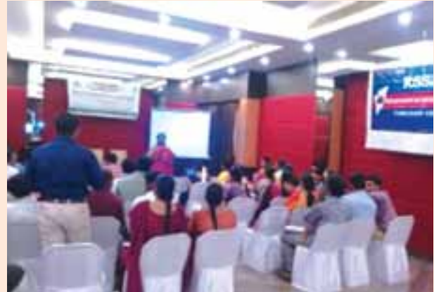
Doctors training program at Thiruvannamalai