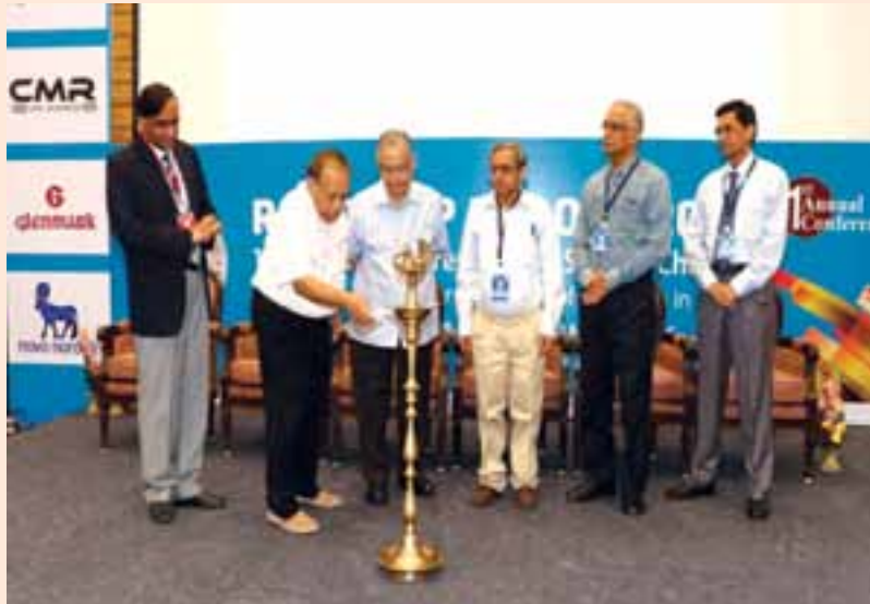
Inauguration and lamp lighting ceremony