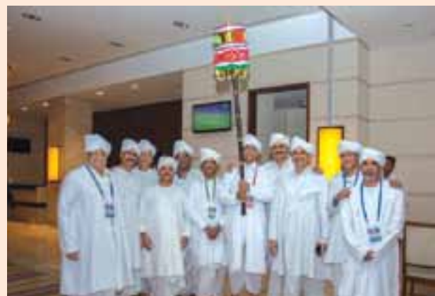
The organizing committee in traditional attire