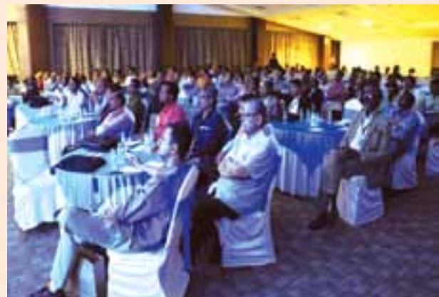
Delegates attending conference