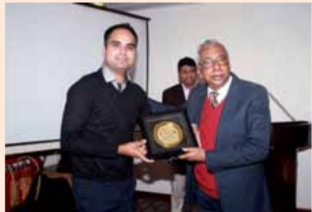
RSSDI Uttar Pradesh chapter mid-term CME