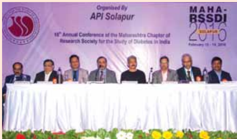
The 10 th Annual Conference of the Maharashtra State chapter