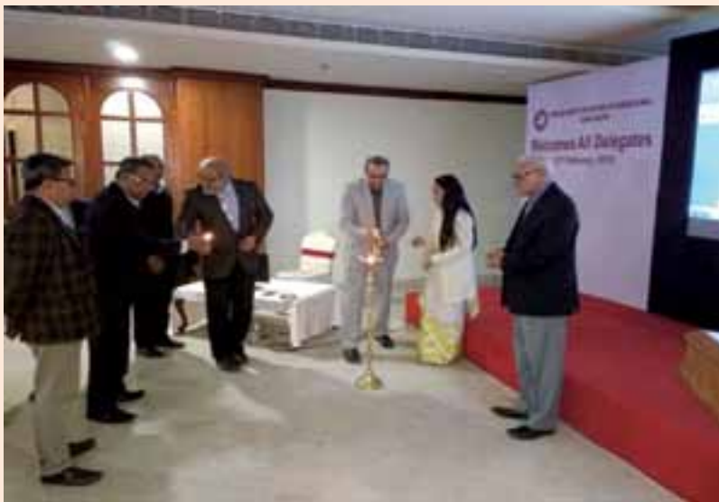
Lamp lighting ceremony and saraswati vandana