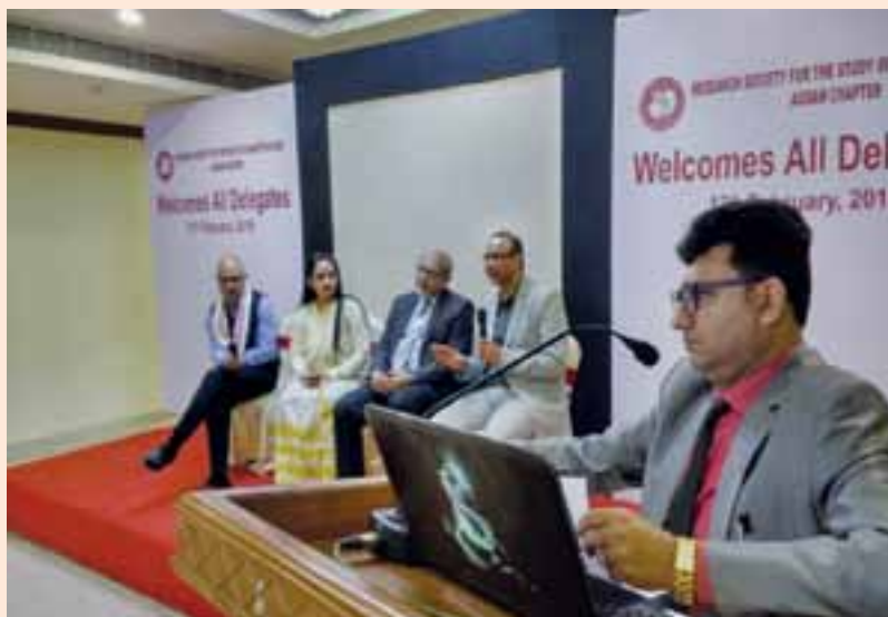
Panel discussion during RSSDI Assam chapter meeting